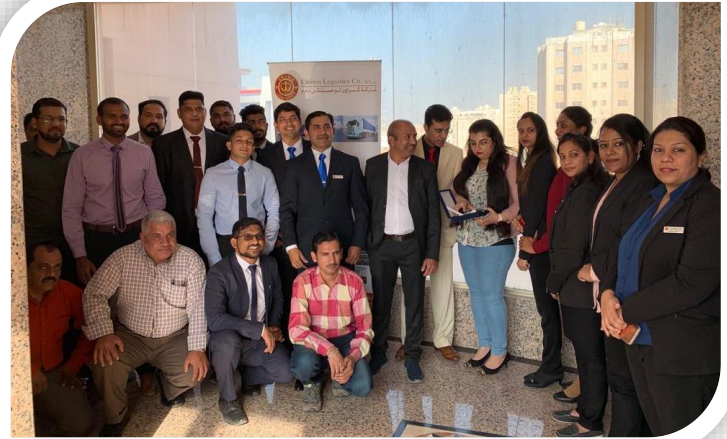
CBG 11 th Anniversary