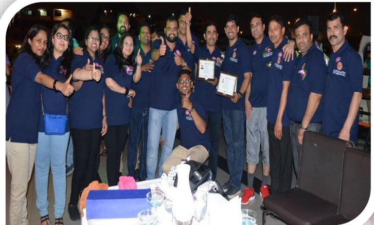
Thailand Trip 2016