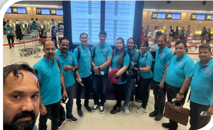
Thailand Trip 2023