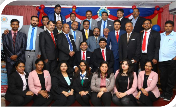
CBG 10 th Anniversary