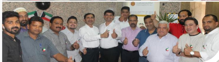
Celebration of Kuwait National & Liberation day