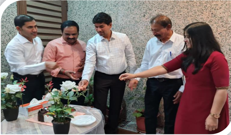
CBG 14 th Anniversary