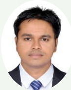
Maxon Co-Founder of Recycling Div.