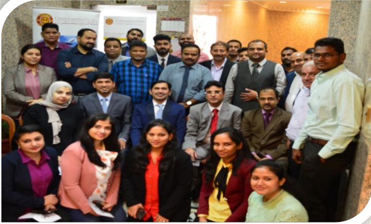
CBG 12 th Anniversary