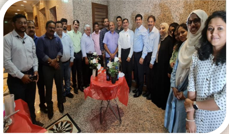
CBG 13 th Anniversary