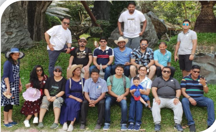
Thailand Trip 2019