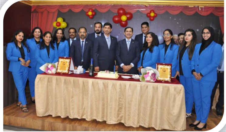
CBG 15 th Anniversary