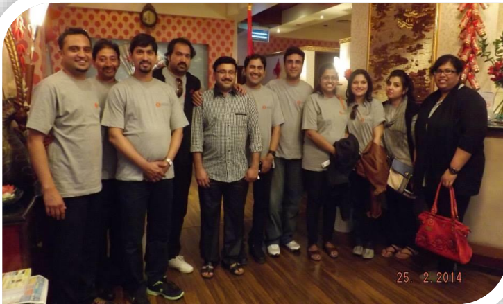
Dubai Trip - 2014